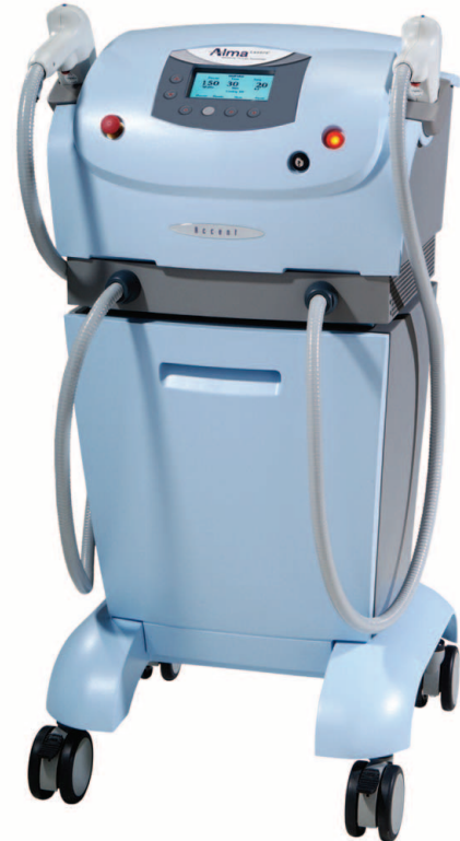
ABOVE: THE ACCENT RF MACHINE

The immediate effect of this heat is to cause the dermal collagen to contract, giving a skin tightening effect. The skin glows and is erythematous for 1–2 hours. There is also a slower progressive effect, where the heat stimulates more collagen production, giving a plumper, more rejuvenated appearance of the skin.