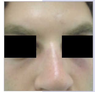
Traumatic Tattoo - Before and 6 weeks after 2 treatments