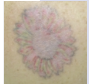
Professional Tattoo - Before and 5 weeks after 2 treatments