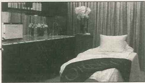
Cornelia Day Spa suites offer a serene and relaxing environment for body treatments.