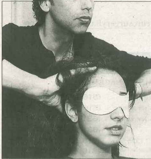
Give your crowning glory the full works at