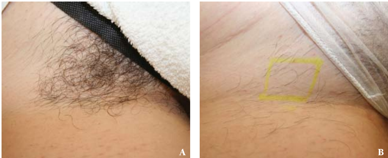
Figure 3. The bikini area of a 42-year-old female before treatment (A) and at 6-month follow-up (B) who achieved an 87.9% reduction in hair counts after 5 treatments with the 810-nm diode laser.

or 144 mm 2 , has also been used in published studies of the 800-nm diode laser. 5 With this larger spot, the coverage rate increases to 288 mm 2 /s, which is still lower than the 360 mm 2 /s of the 810-nm device. The shorter treatment time is an even greater advantage when the 810-nm diode laser is used to treat body areas larger than the bikini area, such as the back and legs.