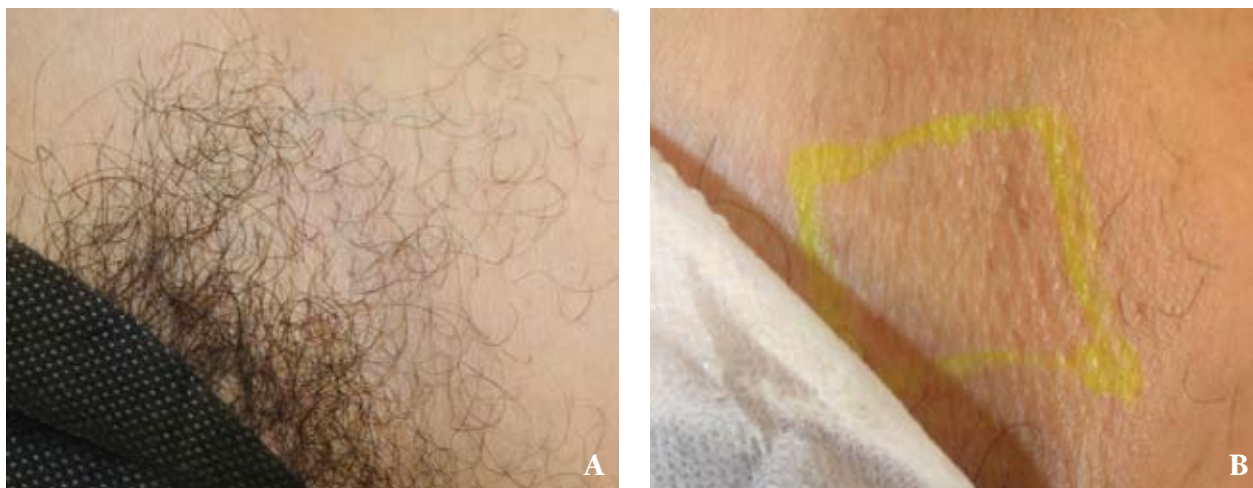
Figure 2. The bikini area of a 44-year-old female before treatment (A) and at 6-month follow-up (B) who achieved an 84.8% reduction in hair counts after 5 treatments with the 810-nm diode laser.

For a laser or light-based device, treatment time is determined by the coverage rate, which is the product of the area of the spot and the repetition rate. 26,27 In our study, the 810-nm diode laser spot was rectangular, measuring 12×10 mm, so the area of the spot was 120 mm 2 . Since the repetition rate was 3Hz, the coverage rate is 360 mm 2 /s. The coverage rate of a comparable 800-nm diode laser device used for hair removal may be similarly calculated. In the study of Lou et al, 13 the spot of the 800-nm laser device was square shaped, measuring 9×9 mm. Since the maximum repetition rate of this device is 2 Hz, 5 the coverage rate is 162 mm 2 /s, less than half of the coverage rate of the 810-nm diode laser used in the present study. A square spot measuring 12×12 mm,