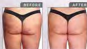
Four treatments of Accent were performed on both the buttocks and thighs to diminish the appearance of cellulite. Procedure performed by Flor A. Mayoral, MD, South Miami, FL.

LASERS CAN BE USED TO TACKLE A HOST OF BEAUTY ISSUES FROM HEAD TO TOE, SO WHETHER YOU ARE LOOKING TO SAY "SO LONG" TO YOUR RAZOR OR "BYE-BYE" TO BLEMISHES, LONG-TERM RELIEF CAN BE AS EASY AS AN APPOINTMENT WITH YOUR DOCTOR AND A LASER.